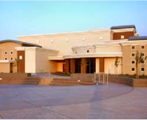
Kitchell specializes in the program and construction management of public sector projects.